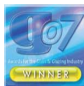
Customer Care Initiative 2007