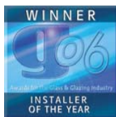
Installer of the Year 2006