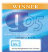
Installer of the Year 2005